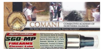
AR-15 1000 Round T & E Testimony - Video